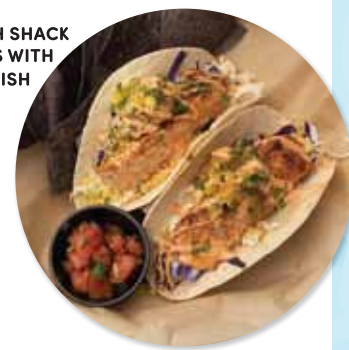
FISH SHACK TACOS WITH RED FISH