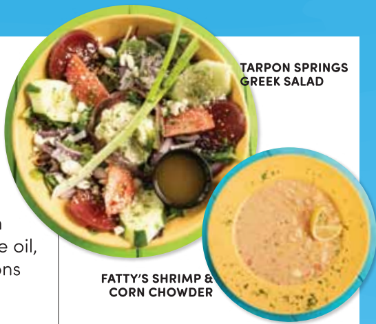
TARPON SPRINGS GREEK SALAD

A Tarpon Springs tradition, mixed greens, potato salad, cucumber, Greek olives, beets, tomato, red onion, anchovies with a side of vinaigrette dressing