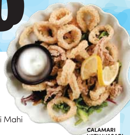
CALAMARI WITH WASABI MAYO

Mango chicken haba ero or southwest beef