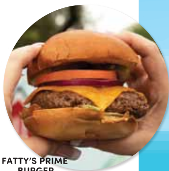
FATTY'S PRIME BURGER

1/2 LB of freshly ground prime beef on a large brioche bun, lettuce, tomato and red onion add your choice of cheese 1.00 add bacon 1.50