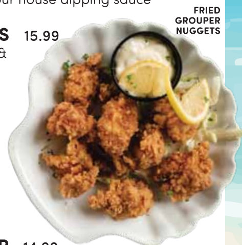
FRIED GROUPEL NUGGETS