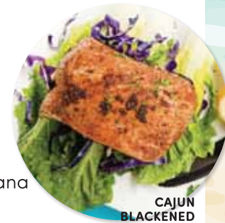
CAJUN BLACKENED REDFISH

Two free-range, antibiotic-free chicken breasts perfectly seasoned with salt, pepper, garlic and grilled