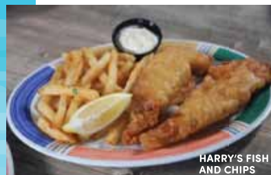
HARRY'S FISH AND CHIPS