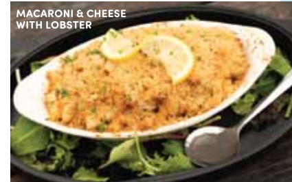
MACARONI & CHEESE WITH LOBSTER