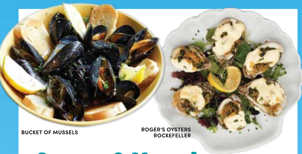
BUCKET OF MUSSELS